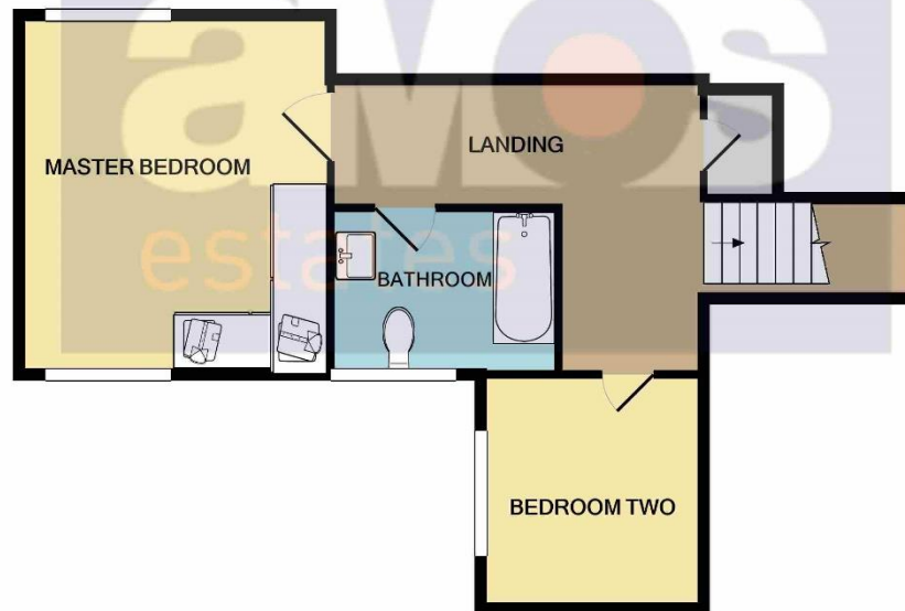
1ST FLOOR APPROX. FLOOR AREA 481 SQ.FT. (44.7 SQ.M.)

TOTAL APPROX. FLOOR AREA 900 SQ.FT. (83.6 SQ.M.)