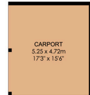
NOT SHOWN IN ACTUAL LOCATION/ ORIENTATION

APPROXIMATE GROSS INTERNAL AREA: 2007 sq ft, 187m 2 (EXCLUDING CARPORT)