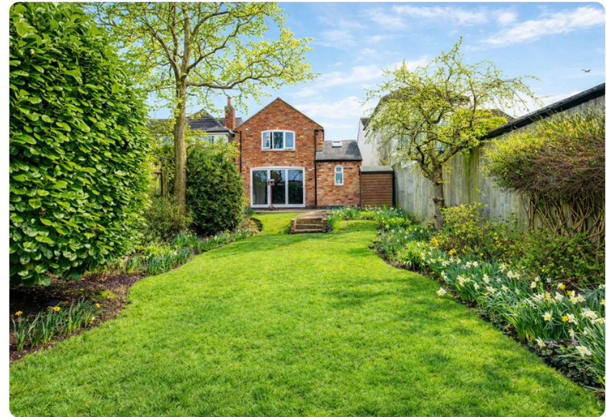
Tye Cottage, Thorpe Langton, Leicestershire