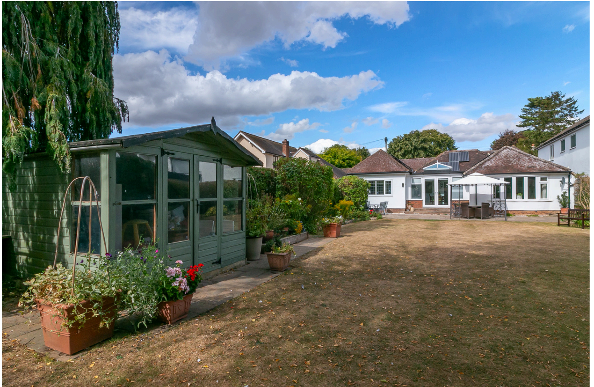
Wedon Way, Bygrave, Hertfordshire